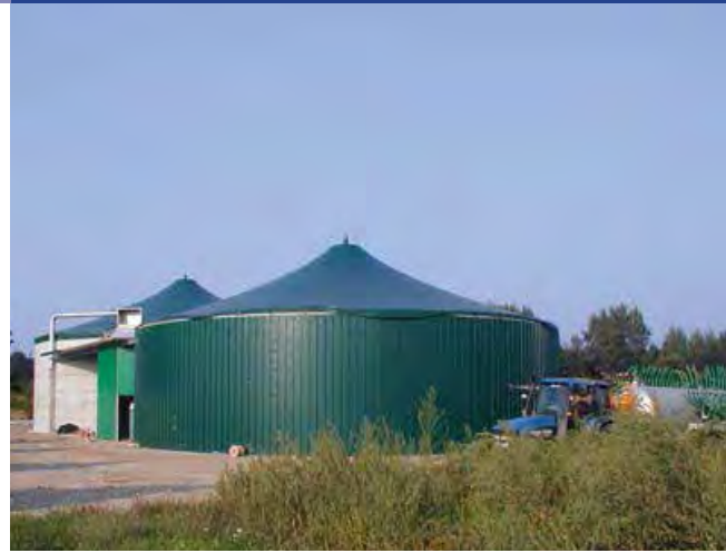
Biogas plant - 500 kW - manure and silage