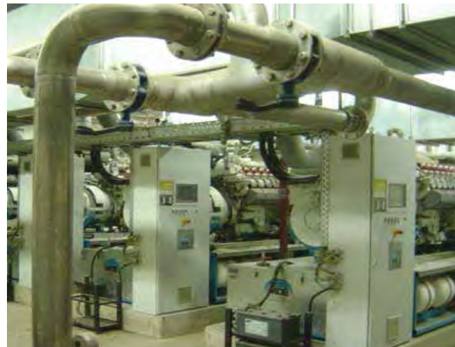
Co-generator - 1.3 MW - food waste