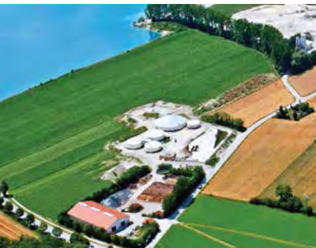
Biogas plant - 500 kW - manure and silage