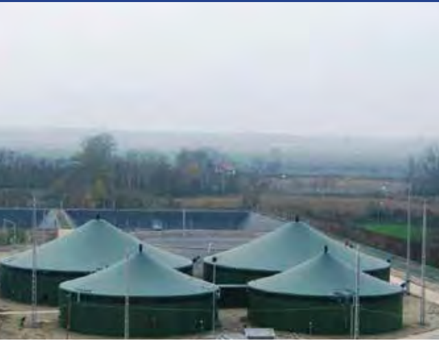
Biogas plant - 1.4 MW - food waste