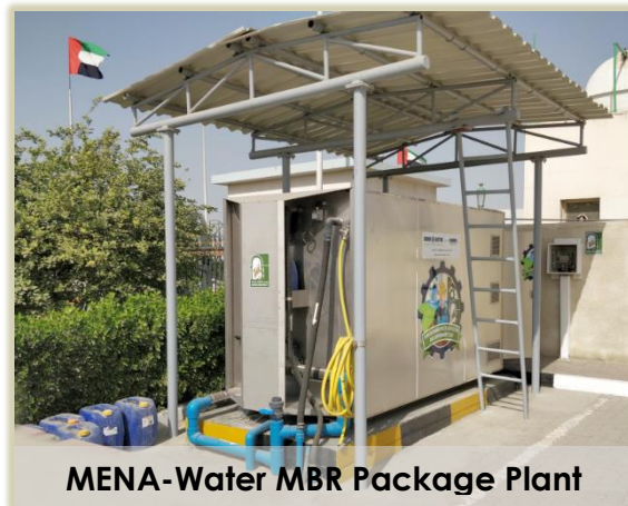
MENA-Water MBR Package Plant

MENA-Water has ensured the client's satisfactory and already saved them a vast amount of fresh water usage and sewage disposal cost, day by day. Allowing for clean vehicles without wasting fresh water.