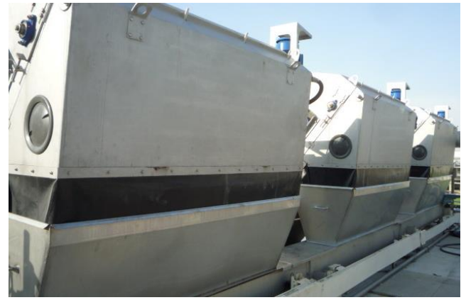
closed screenings discharge