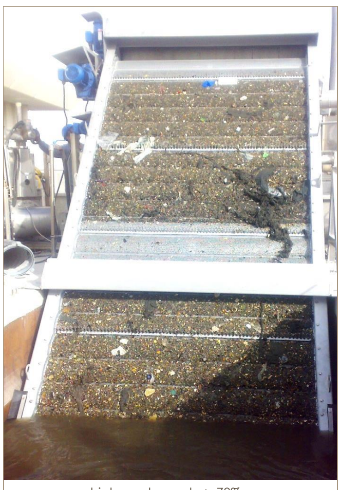
high capture rate > 78%