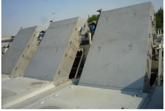
the screens are completely covered