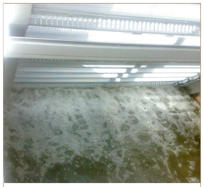
filtered sewerage clear of screenings

filtered fine particles out of the wastewater