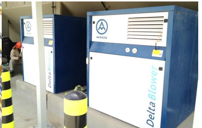
2 x Blower for Aeration (1 duty/1 standby)