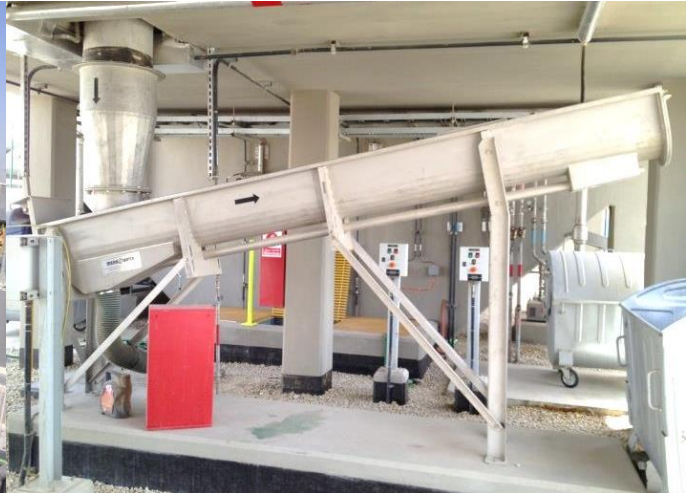
1 x Screenings Washing Conveyor