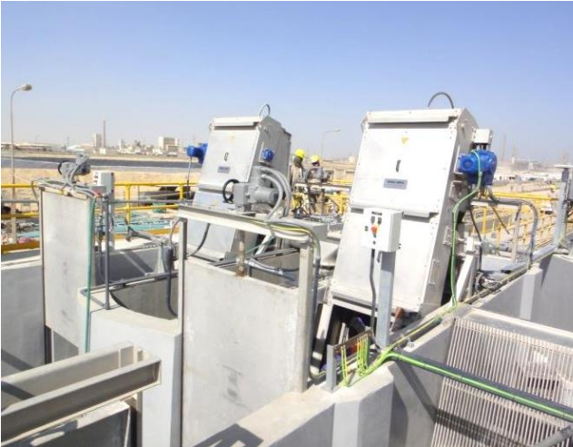
2 x Multi Rake Screen & Manual Screen