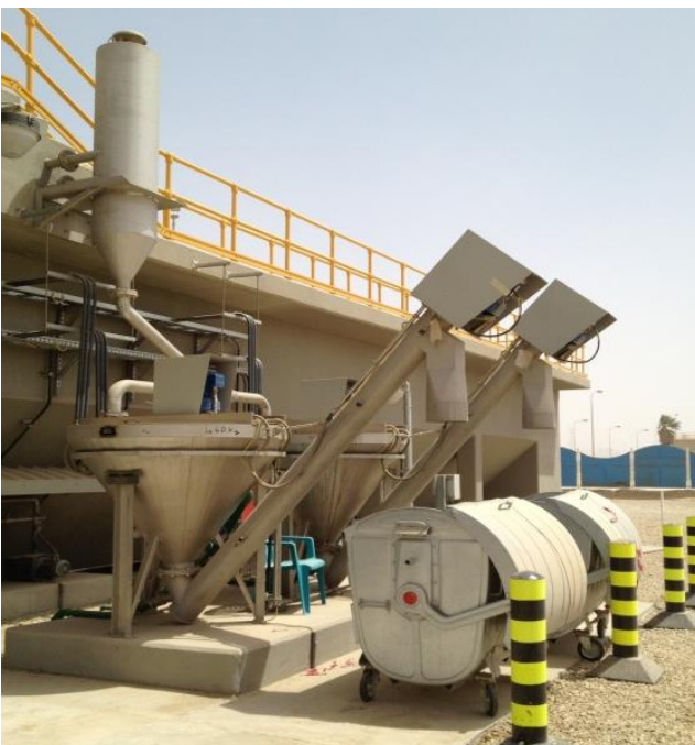
2 x Grit Washer with Degasing Unit