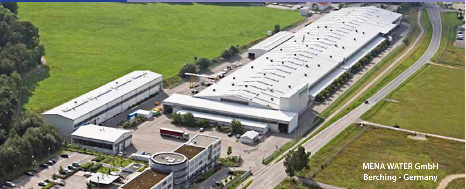
MENA WATER GmbH Berching - Germany

MENA-Water is an engineering and manufacturing company flourishing in the field of water and wastewater treatment. Our main objective is conserving the environment through innovative technical solutions and services. Therefore we focus on the supply of high quality, robust and advanced technology to provide our clients worldwide with efficient and cost-effective purification plants. Our systems feature compact, modular design as well as easy installation and operation conditions. MENA WATER FZC has also acquired ISO 9001:2008, ISO 14001:2004 and OHSAS 18001:2007 to enhance its capabilities from an integrated management system.