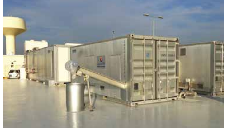
Durrat Al Bahrain STP/MBR 2000 m 3 /day, Bahrain