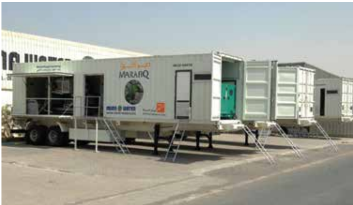
Marafiq Sludge Dewatering - 4 Mobile Plants 4 x 8 m 3 /h, Jubail - Saudi Arabia