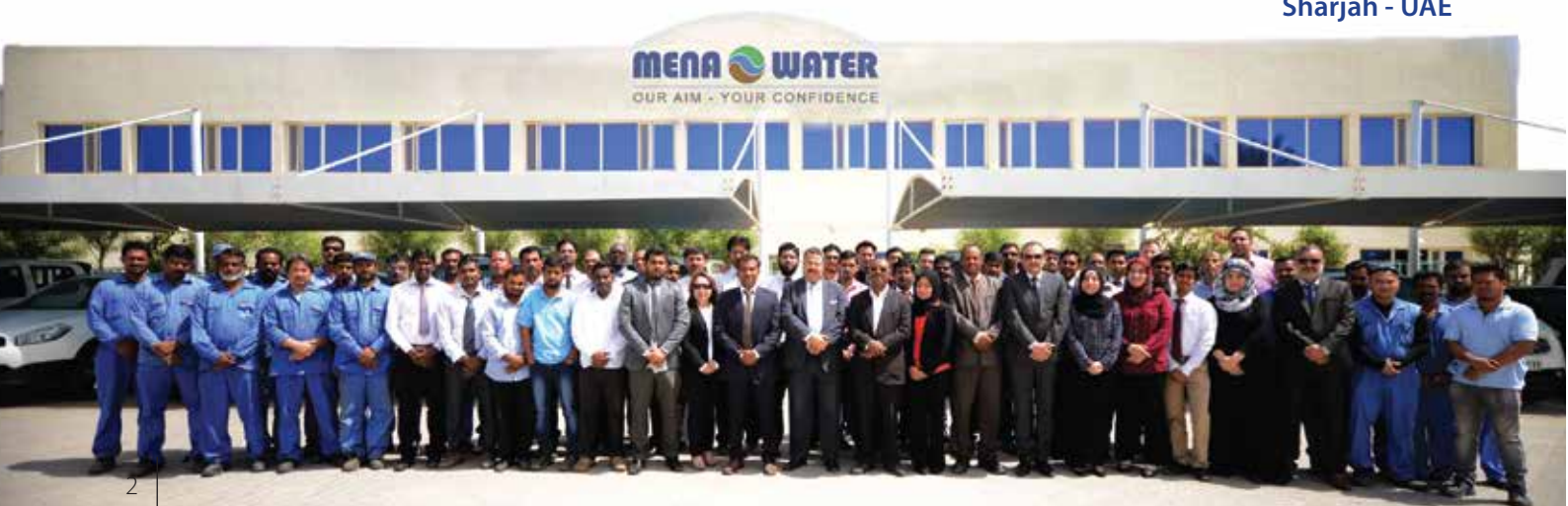
MENA WATER FZC Sharjah - UAE

In addition to manufacturing complete water and wastewater treatment plants we are also specialized in supplying components for following process steps and fields: