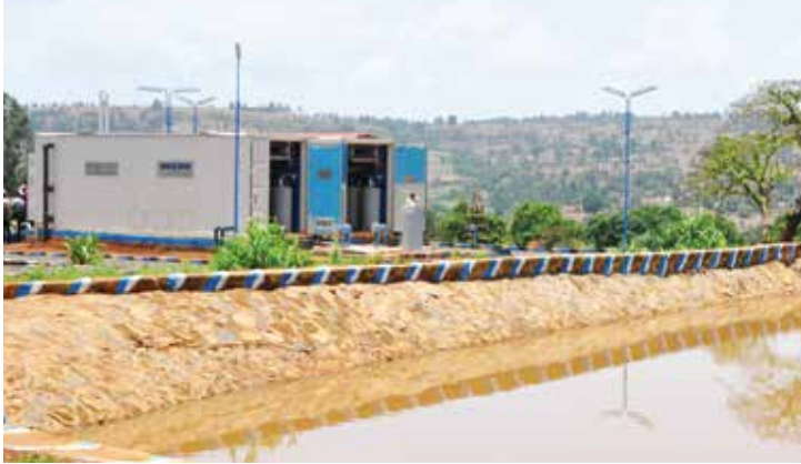
Bako Potable Water Treatment Plant 3000 m 3 /day, Ethiopia