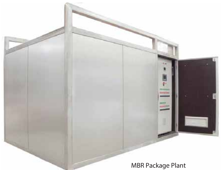
MBR Package Plant MW-MR150