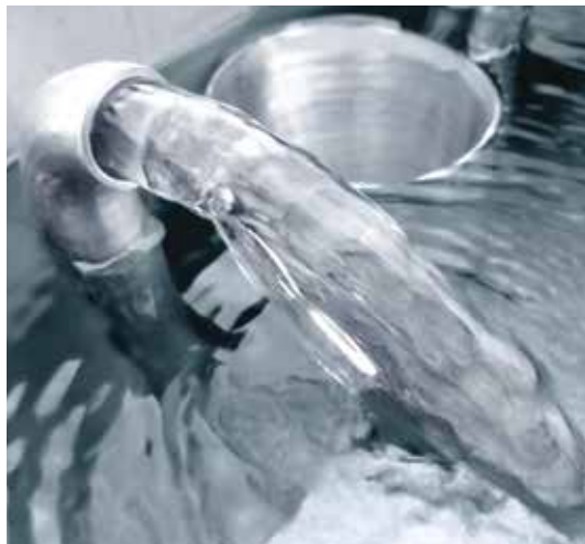
Clean Effluent Water