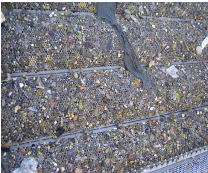
filtered fine particles out of the wastewater