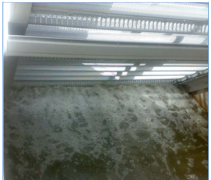
filtered sewerage clear of screenings