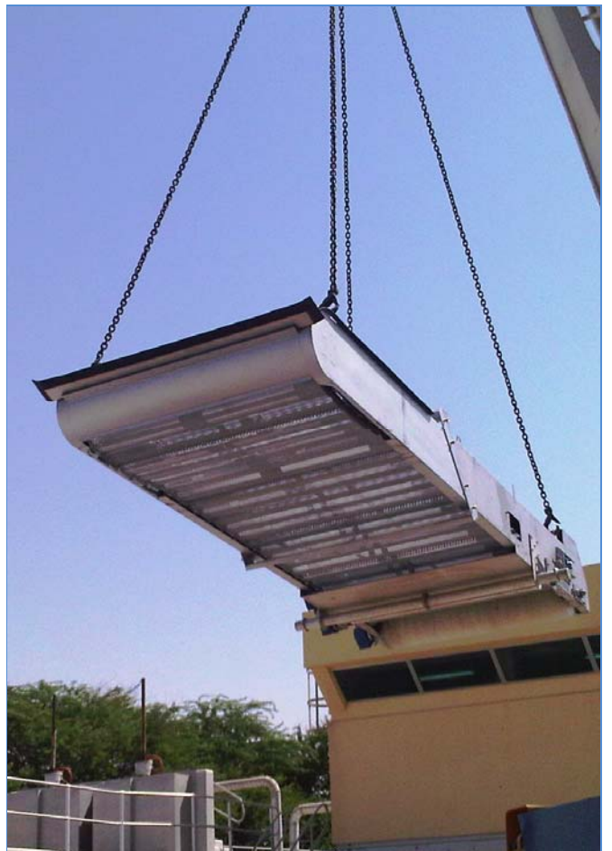
installation of perforated belt screen