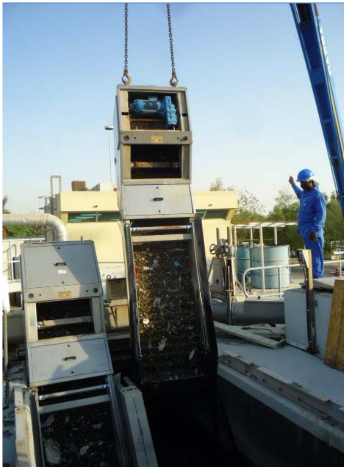
removal of step screen