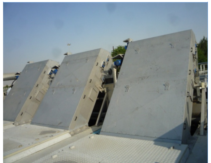
the screens are completely covered