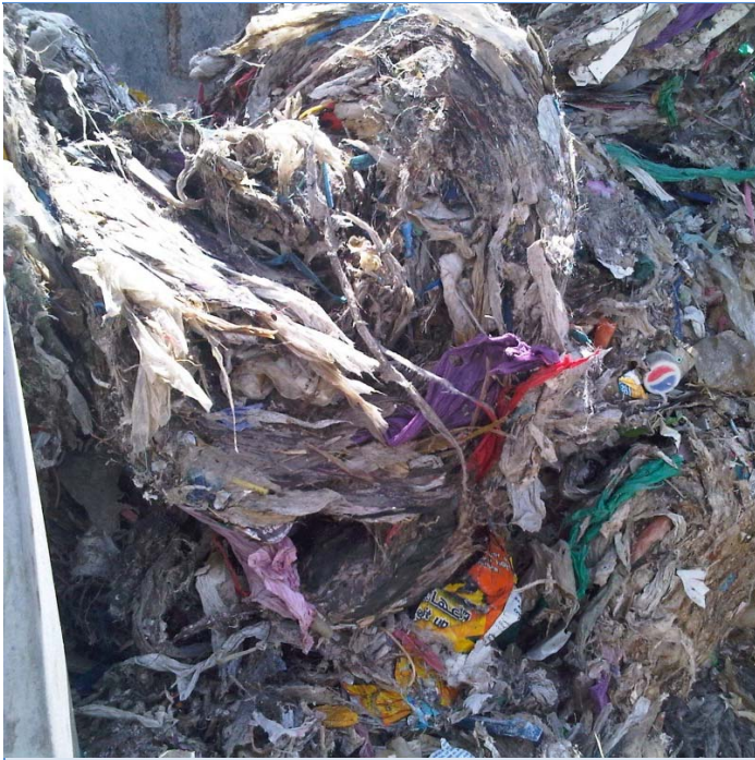
BEFORE: coarse screenings, less capture rate