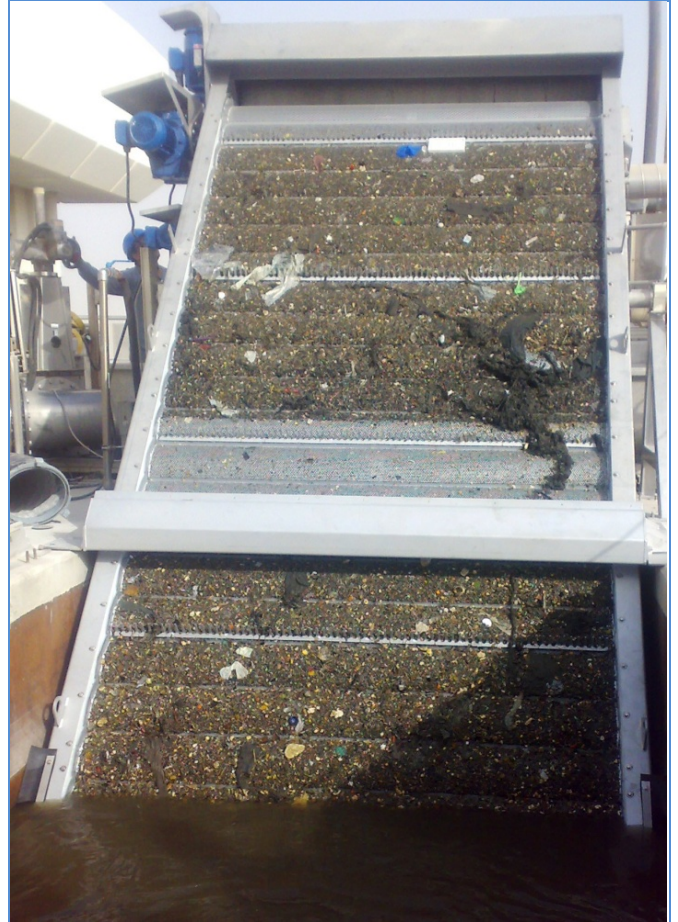
high capture rate > 78%