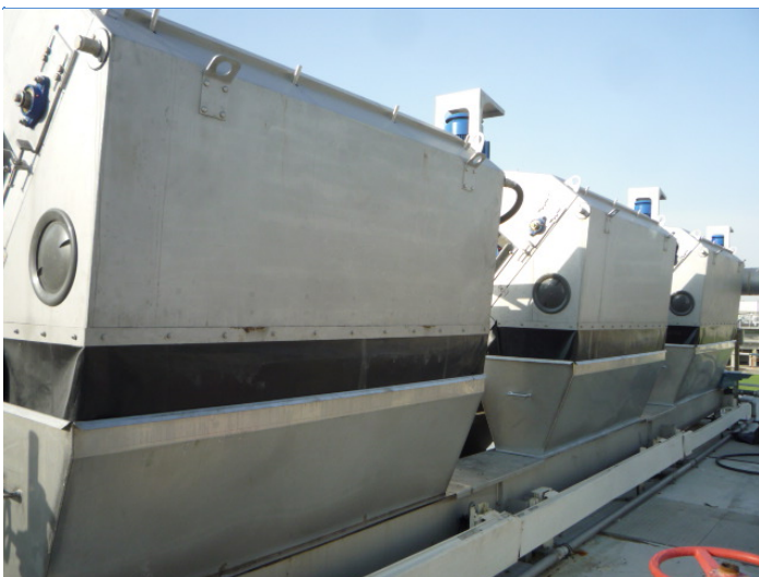
closed screenings discharge