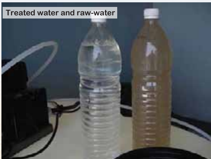
Treated water and raw-water