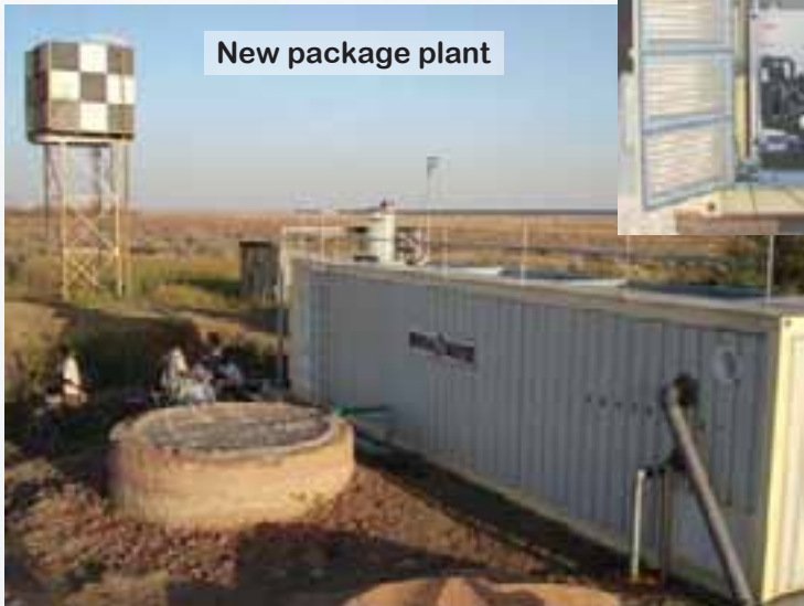
New package plant