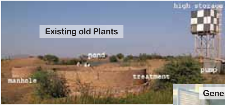
Existing old Plants