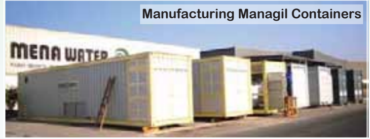
Manufacturing Managil Containers